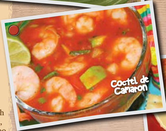
Coctel de Camaron