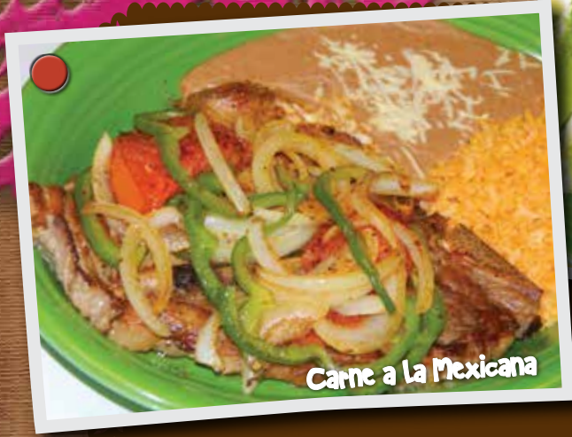
Carne a La Mexicana