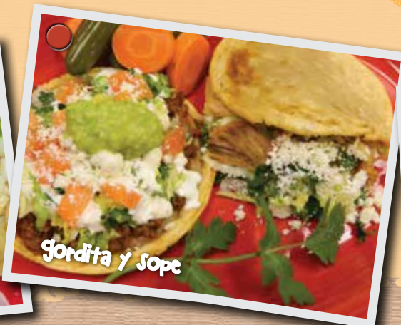
Gordita y Sopa