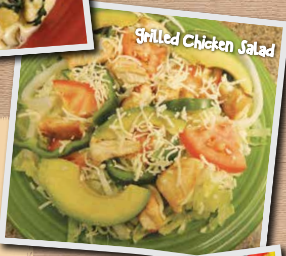
Grilled Chicken Salad