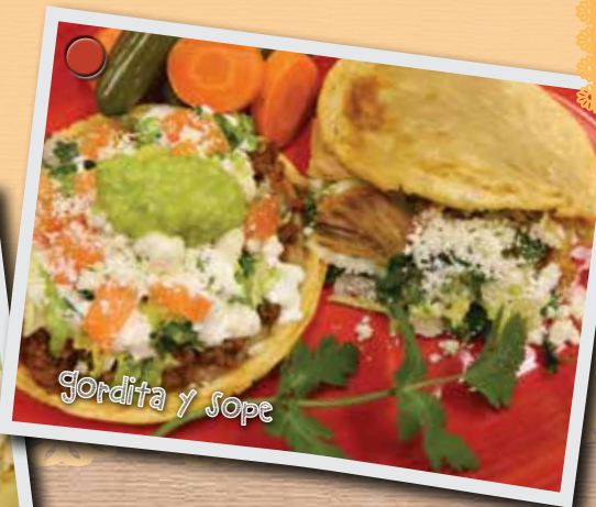
Gordita y Sope